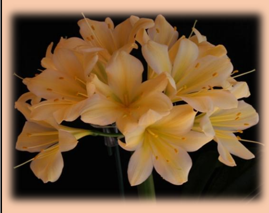
Group I GT peach